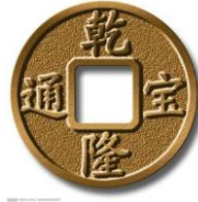
Figure 2 One Specimen of Chinese Ancient Coins